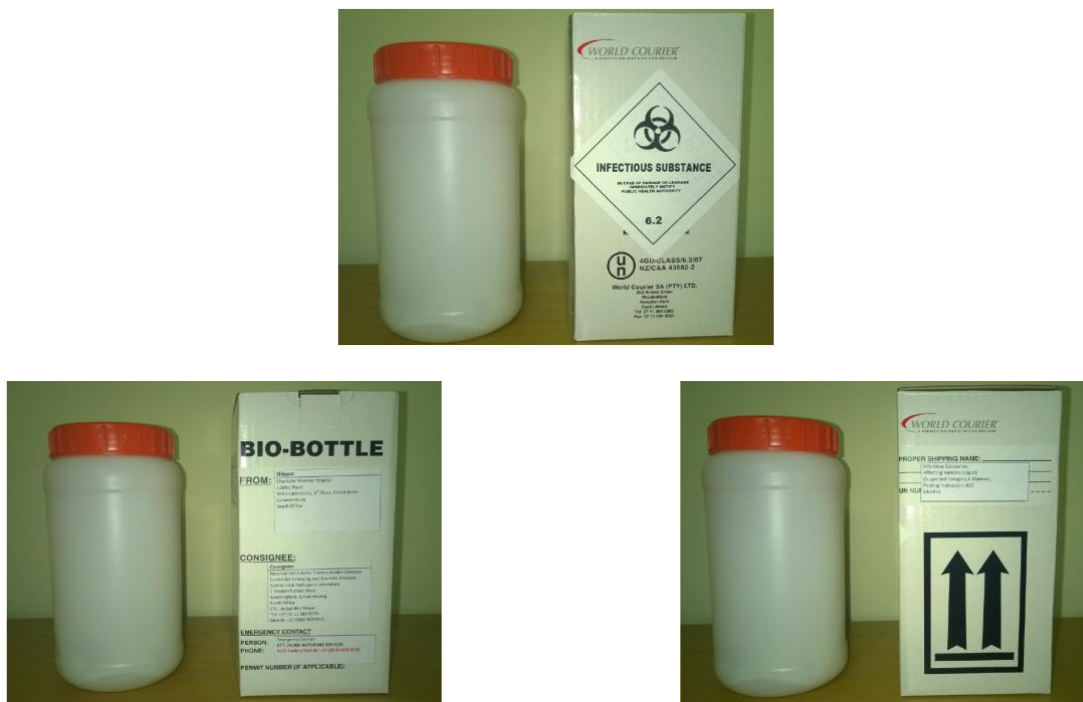
Figure 2: Commercially available category A packaging that will be available to NHLS Laboratories