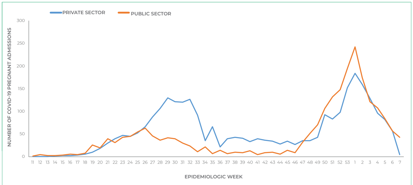
Figure 2. Number of reported COVID-19 admissions in pregnant women of childbearing age, by health sector and epidemiologic week, South Africa, 5 March 2020 - 20 February 2021, n=5,105.

During the first wave, most admissions in pregnant women of childbearing age were in Western Cape and Gauteng provinces. The peak of the second wave exceeded the first wave with most admissions in Western Cape, KwaZulu-Natal, Eastern Cape and Gauteng provinces (Figure 3).